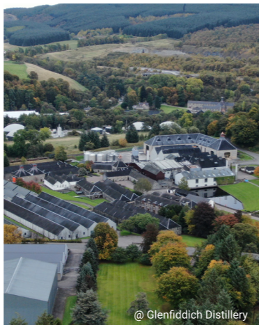
@ Glenfiddich Distillery

As we all know, taste is debatable. Perhaps you are completely satisfied with the taste of an inexpensive Whisky from the supermarket? But what are the actual quality characteristics of a good Whisky?