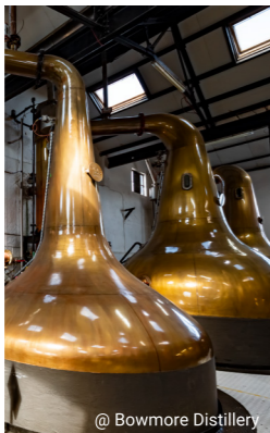
@ Bowmore Distillery

Within the European Union Regulation No. 110/2008 regulates these criteria. German grain would therefore also be Whisky if it was matured in oak barrels. There are many other conditions that go beyond the scope of this introduction. For example, a Thai rice spirit can also be called Whisky.