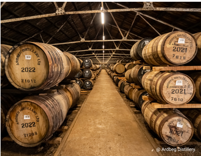
@ Ardbeg Distillery